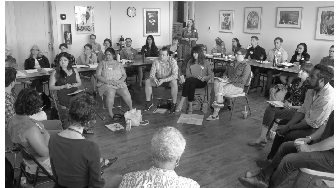
Turning Commitment to Action Cohort

In partnership with the Office of Arts & Culture, RSJI helped Seattle arts groups turn their racial equity commitment into actions for real change. Participating organizations – including the Pacific Northwest Ballet, Seattle Art Museum and a host of smaller arts organizations – used the training to develop racial equity plans within their own organizations, as well as with other artists, their audiences and partners.