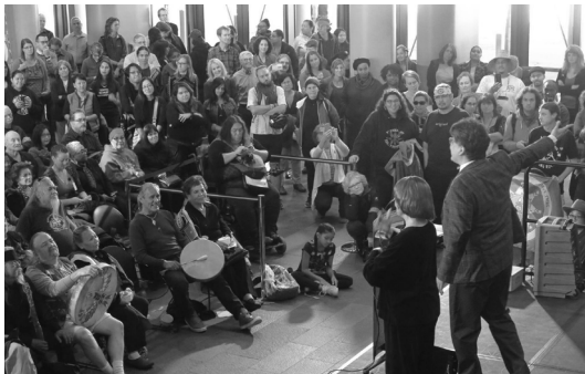
Indigenous People's Day with Sherman Alexie

The annual RSJI Speaker Series brings powerful and provocative speakers from across the country to speak on racial equity. In 2016, RSJI welcomed two extraordinary figures to speak at events that were open to the community: